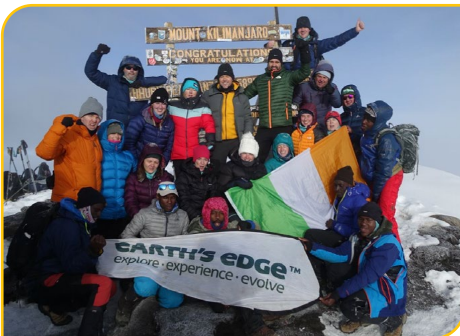
A group of friends (20 in total) from around the country climbed Mount Kilimanjaro in Tanzania in January this year, in aid of Mayo Roscommon Hospice. The group are raising funds through their Go Fund Me page and have already surpassed €12,000.

"The staff at Hospice and in our communities go above and beyond for our patients and their families, and we have the best facilities where patients are cared for with dignity and respect. As we celebrate our first birthday, I want to thank all our supporters, volunteers, fundraisers and donors, as well as the team at RUH for their ongoing incredible work," she added.